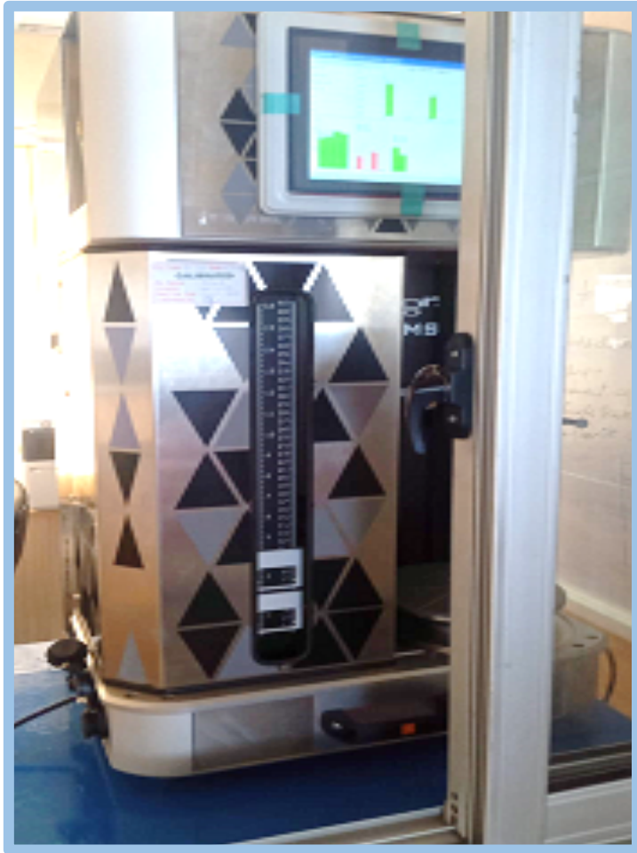
Hot End Coating Thickness Tester