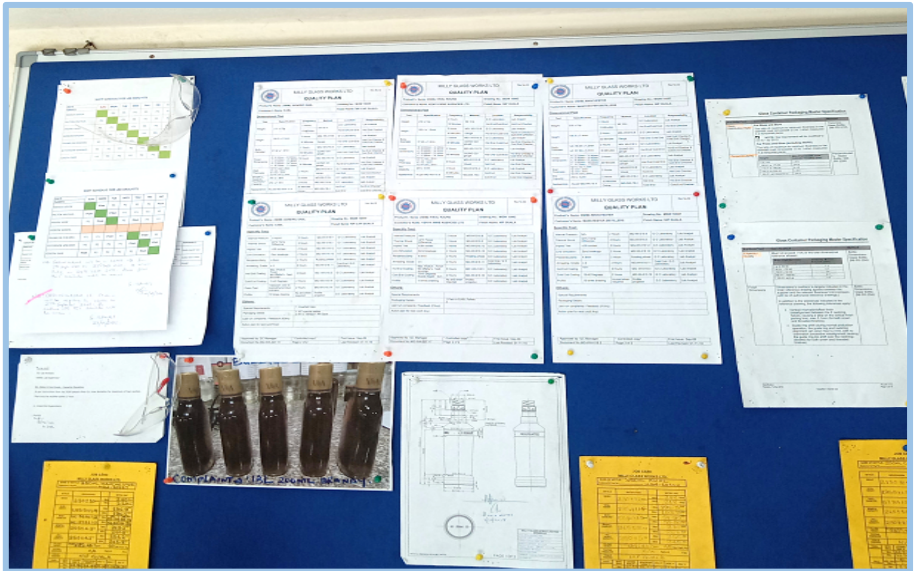
Job Cards Display Board