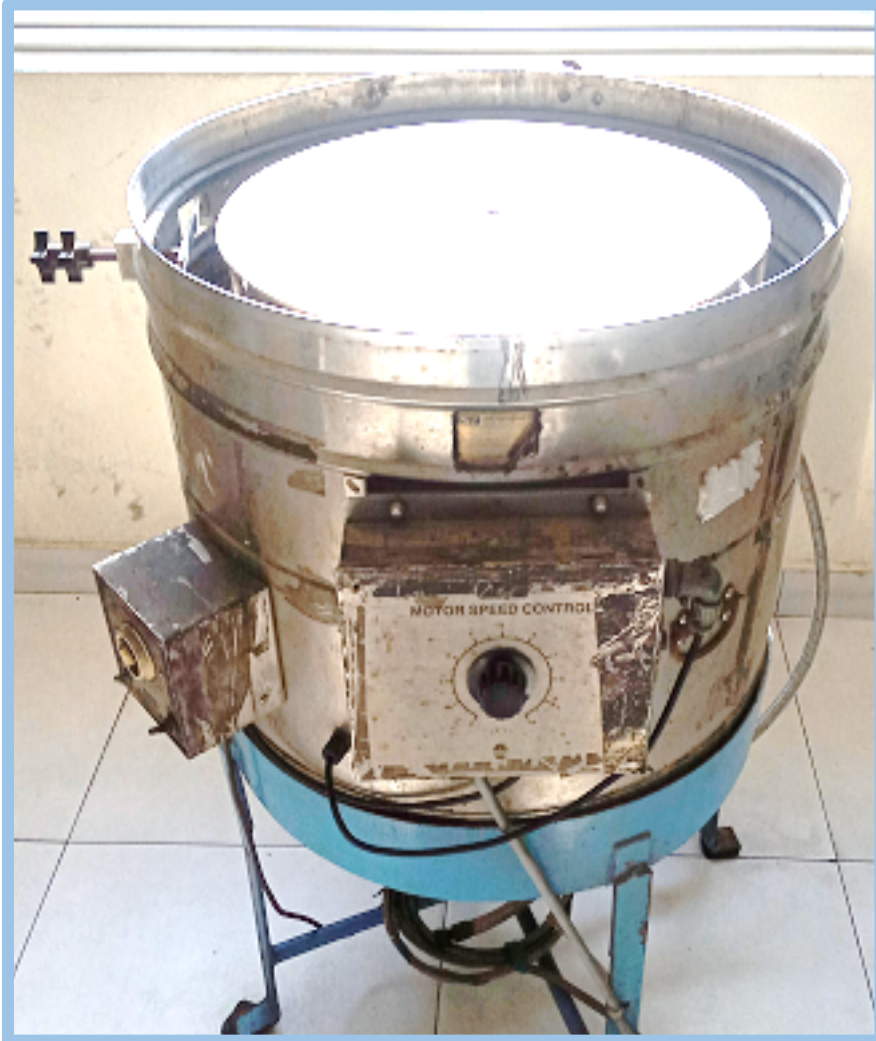
Filling Line Simulator