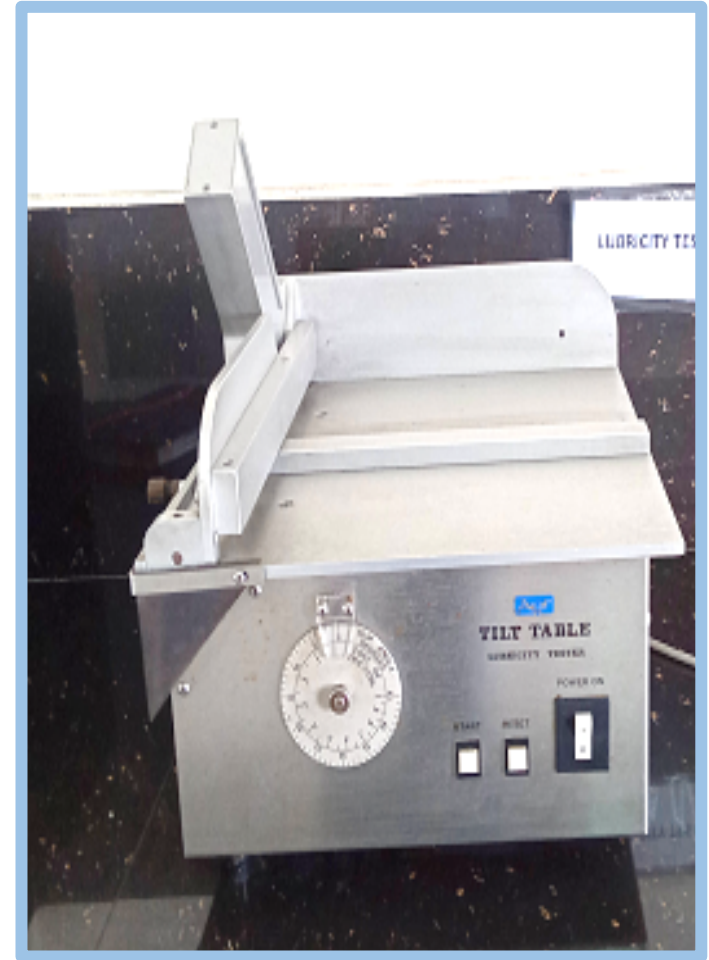
Tilt Angle Testing Machine