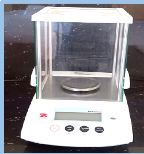
Lab Analysis Weighing Machine